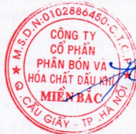
Cao Trung Kiên