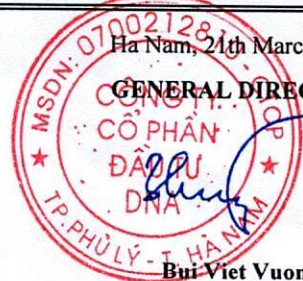
Bui Viet Vuong