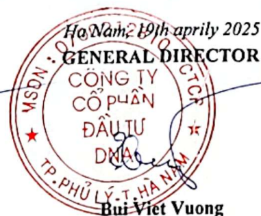
Bui Viet Vuong