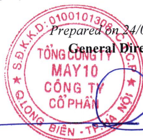
Than Duc Viet