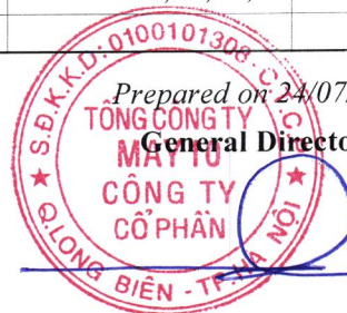
Than Duc Viet