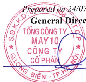
Than Duc Viet