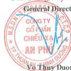
Võ Thụy Dương