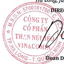
Đoàn Đức Thọ