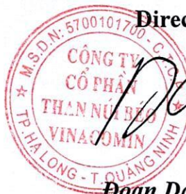
Đoàn Dac Tho