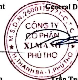
Trần Tuấn Đạt