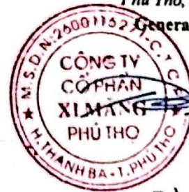
Trần Tuấn Đạt