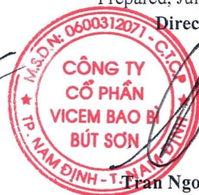
Tran Ngoc Hung