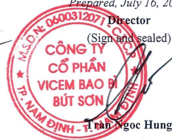
Tran Ngoc Hung